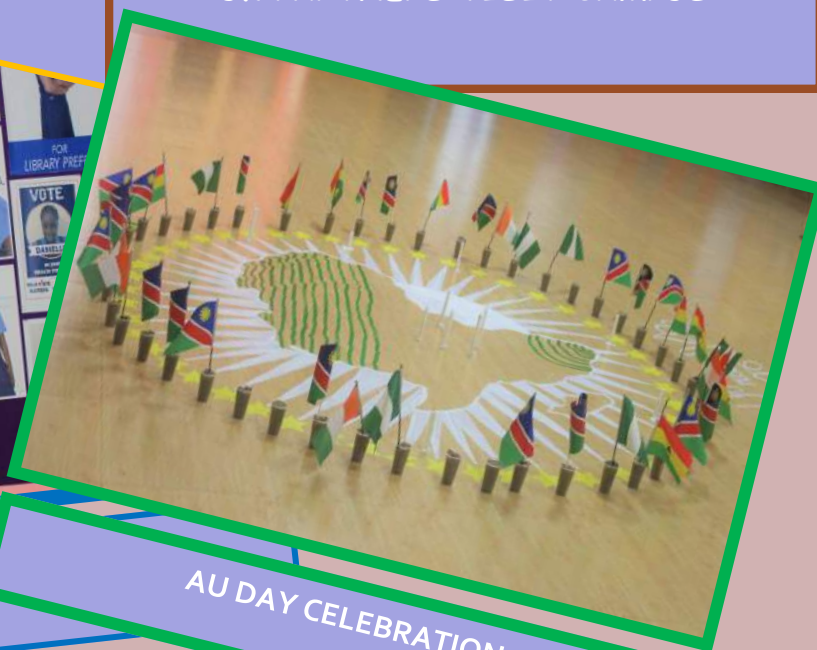
AU DAY CELEBRATION