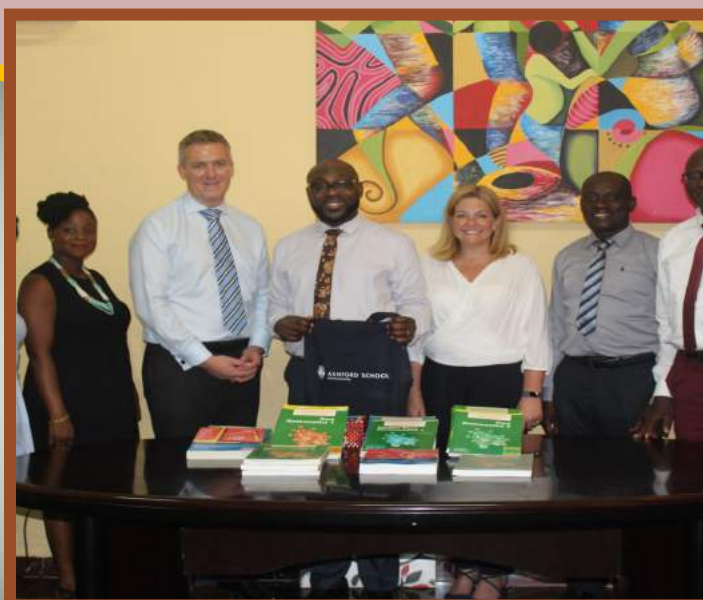
UK PARTNERS VISIT CAMPUS