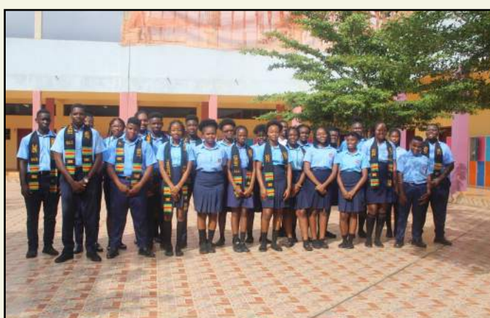
SECONDARY DEPARTMENT (NEWLY INDUCTED PREFECTS WITH OUTGONE PREFECTS)