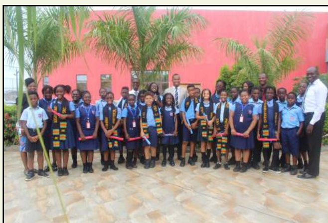
PRIMARY DEPARTMENT (NEWLY INDUCTED PREFECTS)