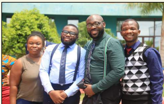
A SECTION OF BIS STAFF POSING FOR THE CAMERA DURING THE VISIT

After meeting with the Principal, they toured the classrooms and were impressed with the dedication and hard work by both staff and students evidenced in daily entries, classroom displays, etc.