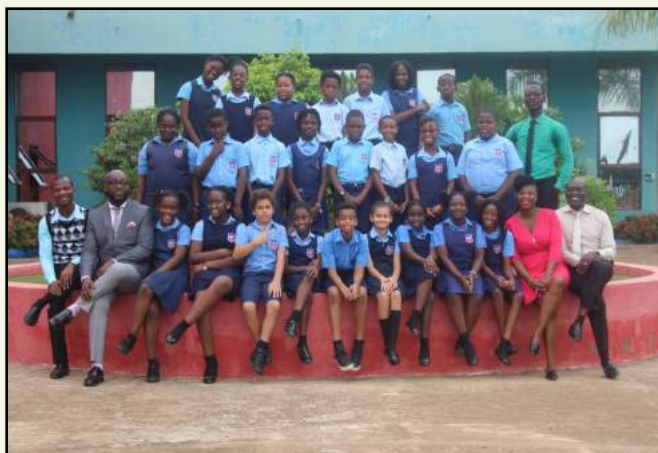
PRIMARY DEPARTMENT (PREFECTS ELECT)