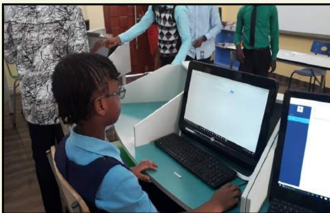
A YEAR 5 STUDENT USING THE E-VOTING SYSTEM