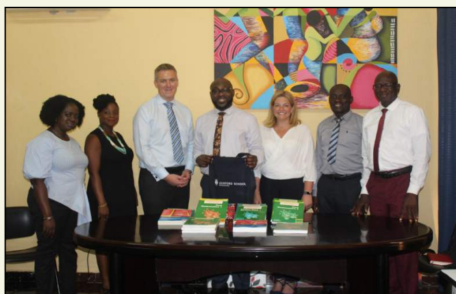
A SECTION OF BIS MANAGEMENT RECEIVING BOOK DONATION FROM ASHFORD SCHOOL (UK)