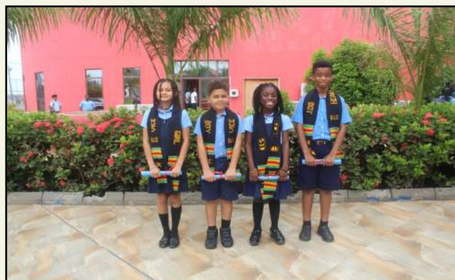
PRIMARY DEPARTMENT (HEAD PREFECTS)