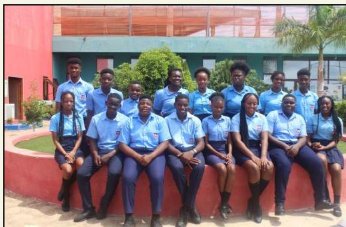
SECONDARY DEPARTMENT (PREFECTS ELECT)