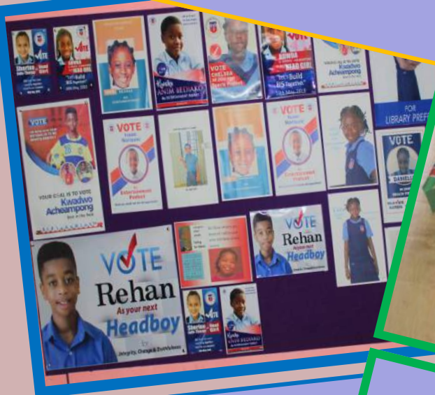
BIS GOES TO THE POLLS