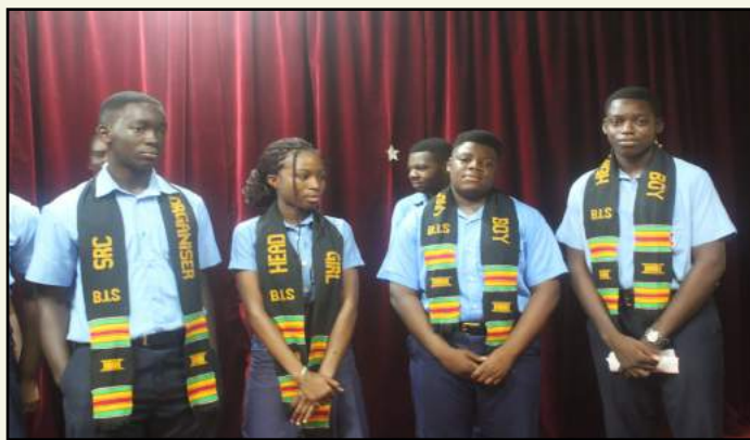
SECONDARY DEPARTMENT-A SECTION OF PREFECTS