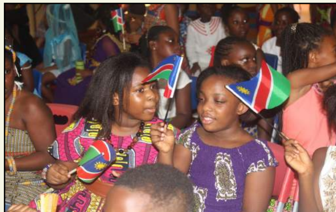
A SECTION OF PRIMARY STUDENTS WAVING THEIR MINIATURE AFRICAN FLAGS TO SHOW SOLIDARITY.

The Kiddie& Primary Department also marked the day.