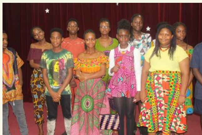
DEBATERS IN A POSE AFTER THE CONTEST.

Years 7 and 8 respectively argued for and against on the topic, "Returnees are a positive impact on a country's economy." On the other hand, Years 9 and 10 respectively argued for and against the topic, "Ghana should accommodate refugees from other African countries." At the end of the keenly contested debate, especially the last few minutes to the end of the second debate between Years 9 and 10 which witnessed the exchange of some refreshing rebuttals, Years 7 and 10