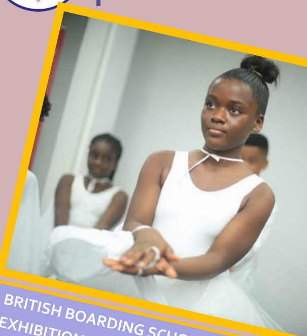
BRITISH BOARDING SCHOOLS EXHIBITION DINNER