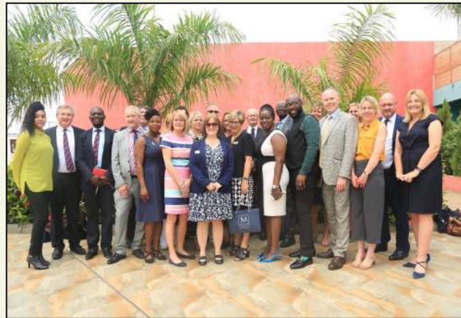
GROUP PHOTOGRAPH WITH OUR UK PARTNER SCHOOLS